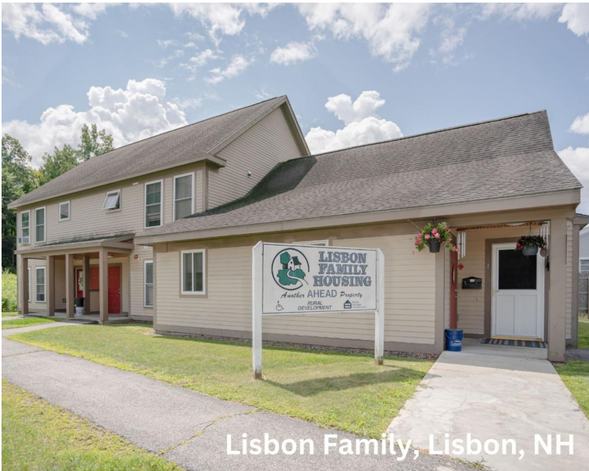
Lisbon Family, Lisbon, NH