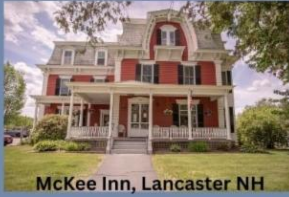
McKee Inn, Lancaster NH