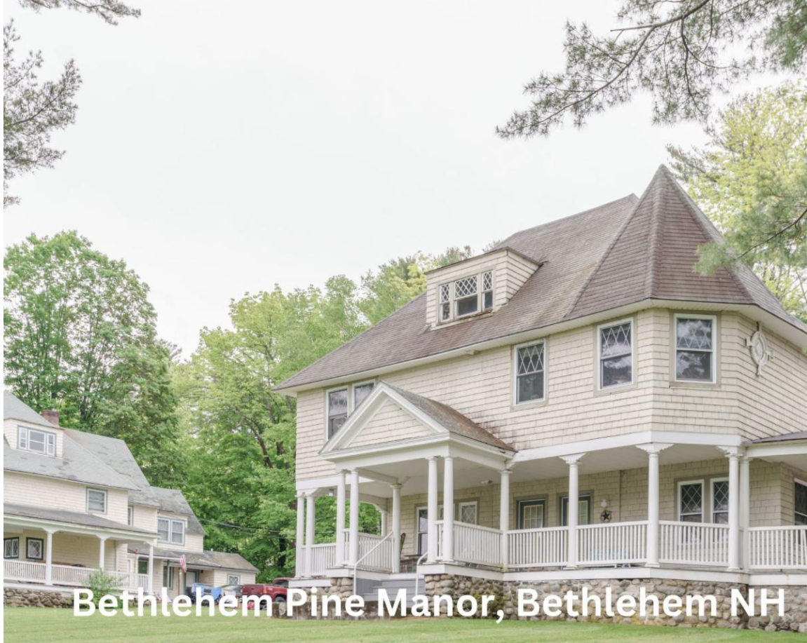
Bethlehem Pine Manor, Bethlehem NH